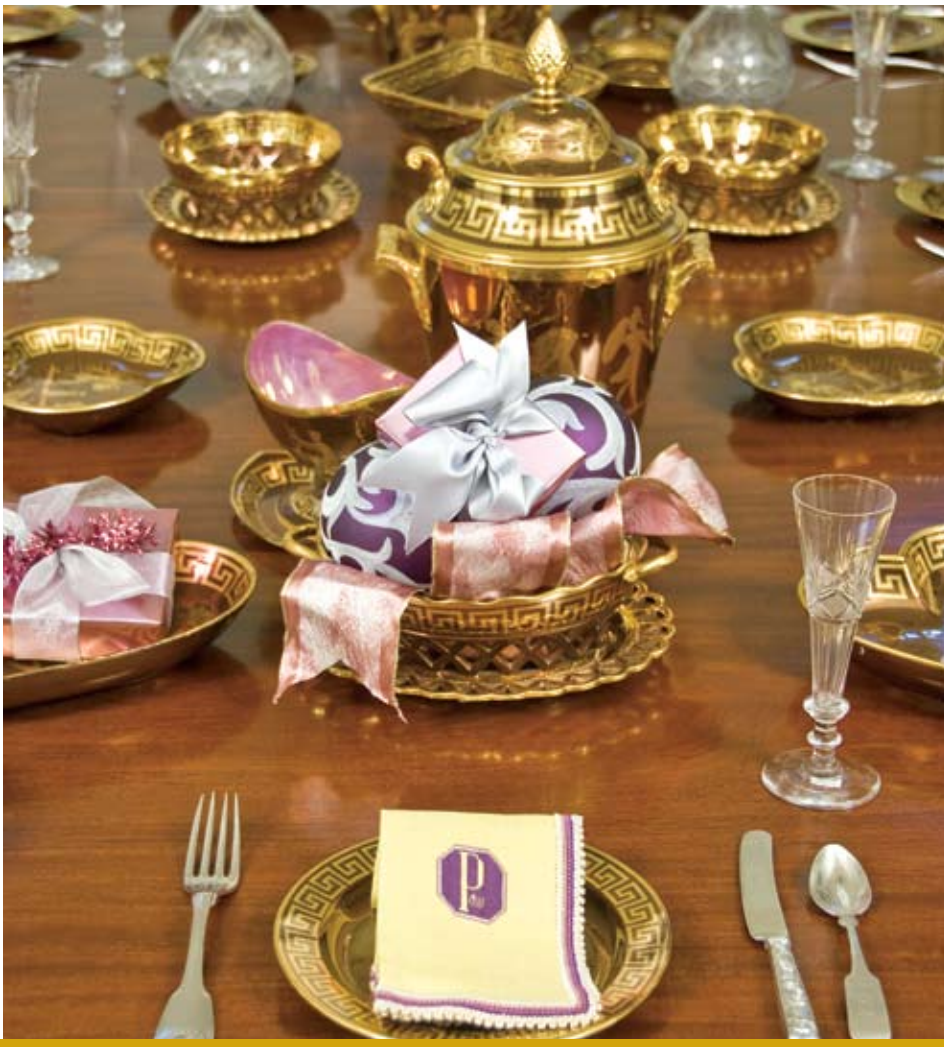
Whimsical table settings recalling holiday traditions of the du Pont family will be on display during Yuletide.