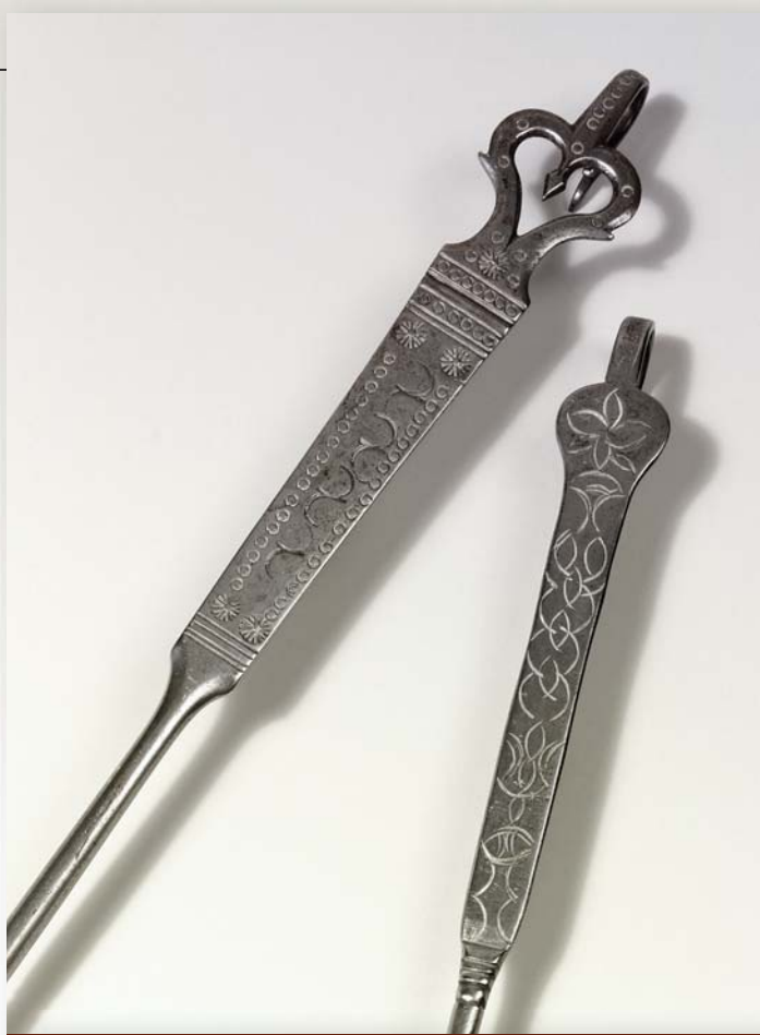
Fig. 2: Spatula detail (left), probably southeastern Pennsylvania, 1775-1825. Wrought iron. 1958.2299; Ladle detail (right), United States, 1775-1825. Wrought iron. 1965.2721. Bequest of Henry Francis du Pont.