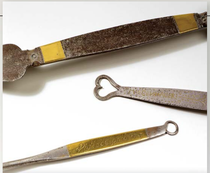
Flesh fork detail (left), probably New England, dated 1757, wrought iron. 1958.2357; Flesh fork detail (right), probably Pennsylvania, dated 1760, wrought iron. 1965.2479. Bequest of Henry Francis du Pont.

The worn engraved decoration on these flesh forks are of trees (left) and a tulip and, along the bottom, a fish (right).