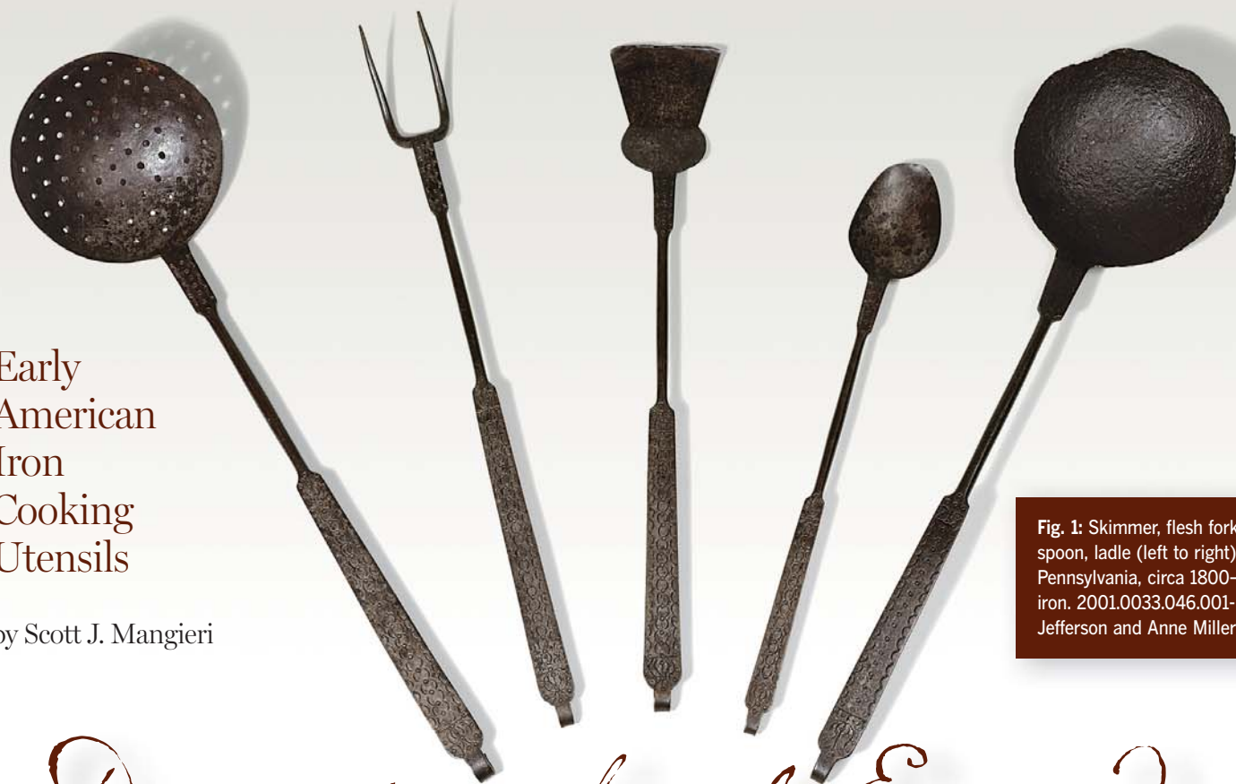
Fig. 1: Skimmer, flesh fork, spatula, spoon, ladle (left to right), Probably Pennsylvania, circa 1800–1850. Wrought iron. 2001.0033.046.001-.004, .007. Jefferson and Anne Miller Collection.