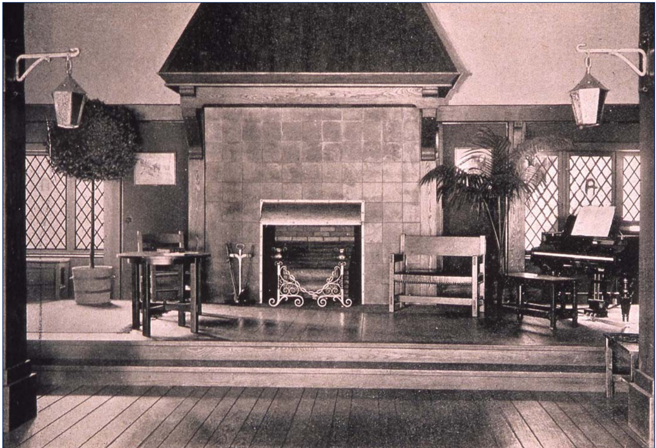
What is Wrought in the Craftsman Workshops, United Craftsman, Syracuse, N.Y. 1904. Printed Book Collection, Winterthur Library

The Winterthur Library's Stickley Collection documents the rise and fall of Gustav Stickley's business enterprises, particularly Craftsman, Inc. Included are business records including bills, cancelled checks, stock information, minutes of corporate meetings, contracts, patents, and the legal records and letters from creditors that relate to the bankruptcy of Craftsman, Inc., in 1916 and the dissolution of the Craftsman Publishing Company. The collection also contains 675 glass-plate negatives and a set of reproduction proofs used in