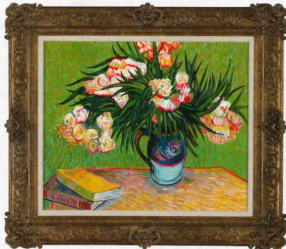
JOHN MYATT'S COPY OF VINCENT VAN GOGH'S CARNATIONS, 2012. COURTESY OF WASHINGTON GREEN FINE ART

To learn more, contact (800) 448-3883 or visit winterthur.org .