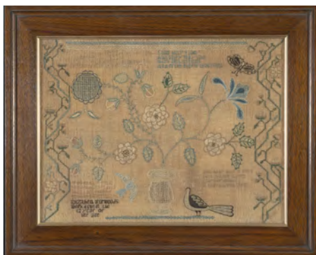
Sampler by Elizabeth Forwood, 1813, New Castle County, DE. Museum purchase with funds drawn from the Centenary Fund 2016.16